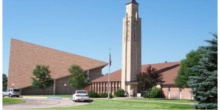
Ward 2: First United Methodist Church 1600 West E