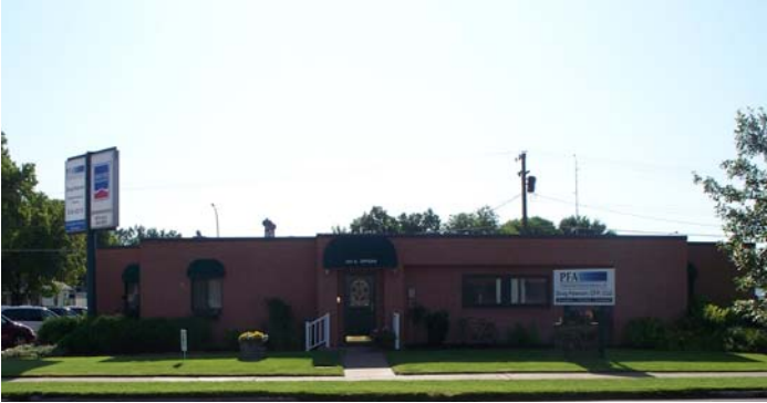
Ward 1: Professional Financial Advisors 501 S. Jeffers