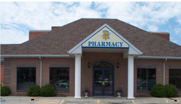
Ward 3: Rx Express Pharmacy 402 N. Jeffers