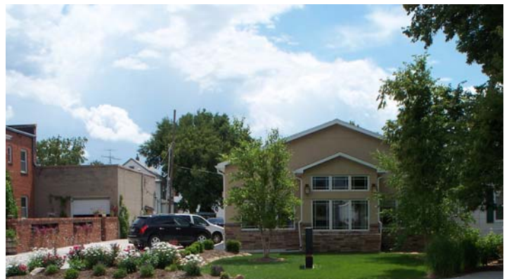
Ward 4: Elliott Law Office 210 W. Front St.