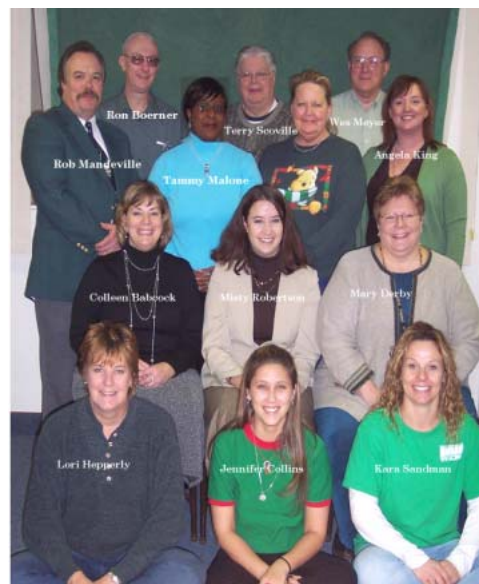
Staff & Board Members

grant award was in the amount of $44,623.00, to cover operational, staff, and programming costs. KNPLCB also received funding to continue its work on increasing participation in local recycling opportunities. The group will continue its 'Don't Be a Tosser' advertising campaign, assist with subsidization and management of the 24 hour recycling trailers, and work to turn local events into 'Green Events' by providing extra trash and recycling receptacles for use. The group's recycling program was awarded $20,634.00. The organization's final award was in the Cleanup category for $15,000.00. The 2007 Cleanup program will continue to see volunteers removing litter and debris from Lincoln County roadways, river banks, park systems, trails, and Interstate lake systems. The Cleanup program is complementary to the educational programming from KNPLCB staff. The Cleanup program provides volunteer organizations and families the opportunity to raise funds for their activities while giving of their time, energy, fuel, and equipment. The groups clear litter from their assigned areas every spring and fall. The Cleanup program also seeks to engage community groups in cleaning up